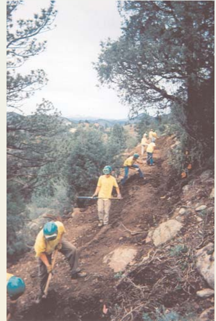
It's that time of year again; Jefferson County Open Space revs up for the Youth Work Program.