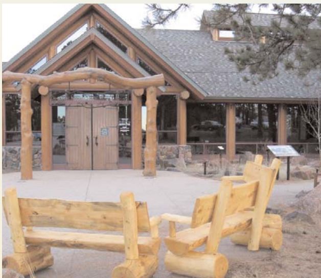
Facility upgrades take place at the Lookout Mountain Nature Center.