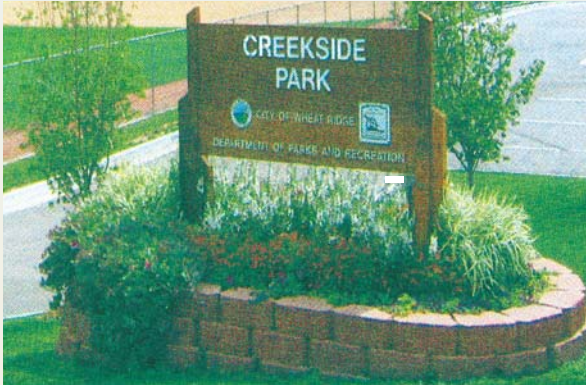
Wheat Ridge's Creekside Park receives Joint Venture Funds.

and State Highway 93 intersection to Tunnel One. Several elements are involved, the first being a connection from the City of Golden's natural surface trail on the north side of Clear Creek to the Open Space property on the south side of Clear Creek. The placement of the bridge for trail users across Clear Creek will provide public access to an area known as Grant Terry Park.