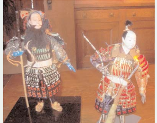
The Asian Doll Exhibit at the Hiwan Homestead Museum.